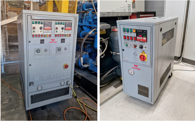
TOOL-TEMP Temperature Control Units in field-application.